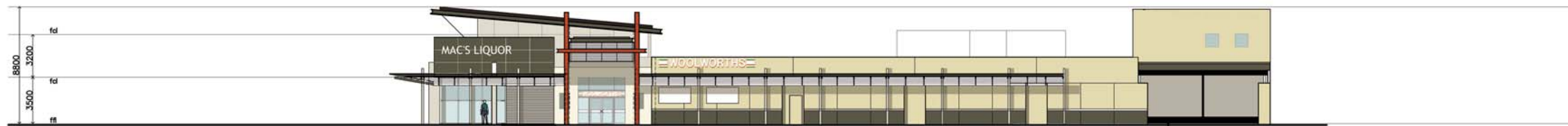
SOUTH ELEVATION PROPOSED