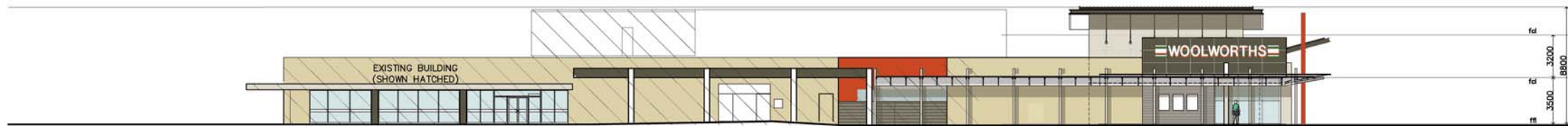
WEST ELEVATION PROPOSED